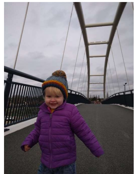
Dora tried out the new bridge over the A52